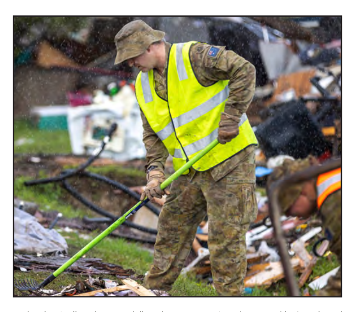
An Australian Army soldier cleans up water-damaged belongings in Lismore, New South Wales, as part of Operation Flood Assist 2022.

requirement for a common operation picture across government and non-government agencies; liaison officer requirements; logistics considerations; High Risk Weather Season preparation including planning; exercising; and education and continuation training. Though a wide range of topics were covered during the lessons collection activity; the work undertaken by ACMC in conjunction with the flexible learning approach shown by Headquarters JTF629 will see the task force as a whole, better prepared for the 2022/2023 domestic High Risk Weather Season.