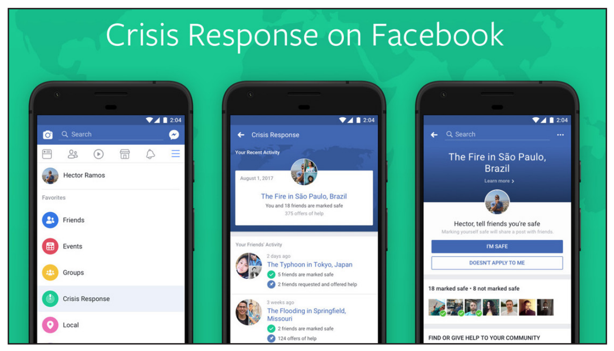
Figure 2: Facebook's Safety Check Function

2.3 Social media democratises communication to the extent that citizens are now empowered - often via powerful multimedia capable smartphones - with the means to capture a wide range of content from audio, images and video. This content can be used to inform or support a range of important processes that help underpin humanitarian assistance, conflict reduction and peace building activities. Social media has become an important platform for witnessing and citizen journalism, specifically of human rights abuses, electoral and peace monitoring, and for wider networking and building communities of interest. It has also become central to rapid-onset emergencies with the platforms supporting a wide range of emergency functions from short-term event specific 'pages' promoted by emergency support organisations and affected communities to functions that let friends and relatives know a person is 'safe', such as Facebook's safety check function.