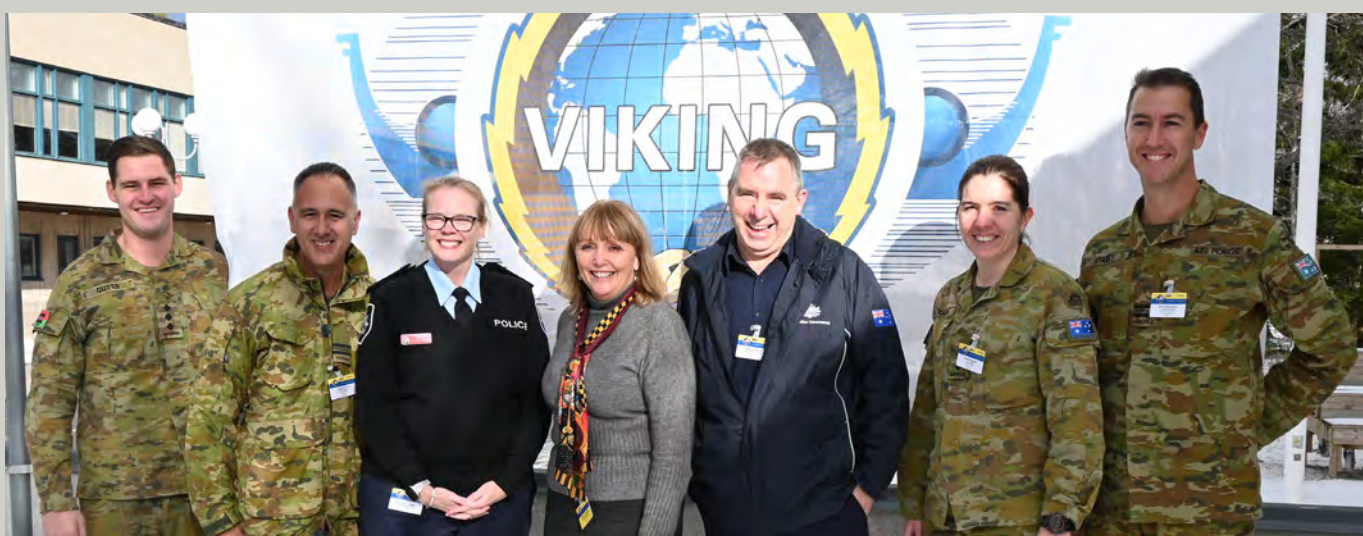
AUSTRALIAN GOVERNMENT CONTINGENT - VIKING 22

The countries in the Northern Continent scenario were fictional and were configured to reflect States with multiple security challenges. Regional instability in the form of civil wars, insurgents and humanitarian crises marked the scenario. Weak States were under pressure to maintain law and order and their respective territorial integrity in the face of internal disagreements and growing separatist movements and conflict.