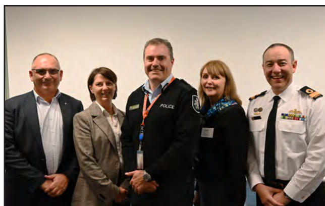
The Panel - officials from EMA, DFAT, AFP, ACMC and ADF.