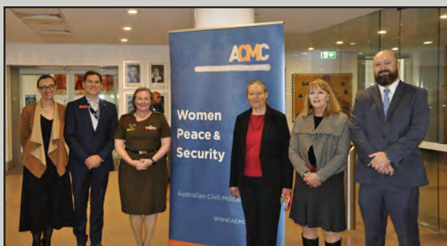
The inaugural Government-Civil Society Engagement Meeting

Through dialogue, grounded in evidence and lived experience, there is an opportunity to ensure that the core tenets of the WPS agenda of participation, protection and prevention are at the forefront of informing Australia’s foreign policy, diplomatic, defence and development efforts.